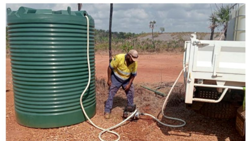
Justin pumping water into the wash down tank