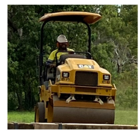
Tyreece operating the roller

During the month of March the Civil Trainees continued their classroom and hands on training in their Certificate III in Civil Construction Plant Operations course, undertaking training in the operation of skid steer, roller, excavator and backhoe machinery.