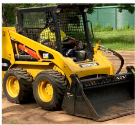
Gabby operating the skid steer loader

During the month of March the Civil Trainees continued their classroom and hands on training in their Certificate III in Civil Construction Plant Operations course, undertaking training in the operation of skid steer, roller, excavator and backhoe machinery.