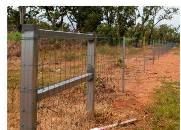
Fence line completed by Civil Trainees

The trainees also completed the fencing component of their Certificate II in Conservation and Ecosystem Management course, installing a boundary fence on a local Coomalie business property.